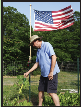
Safe on windy days

SAVE your BACK, your MONEY and your ENVIRONMENT.